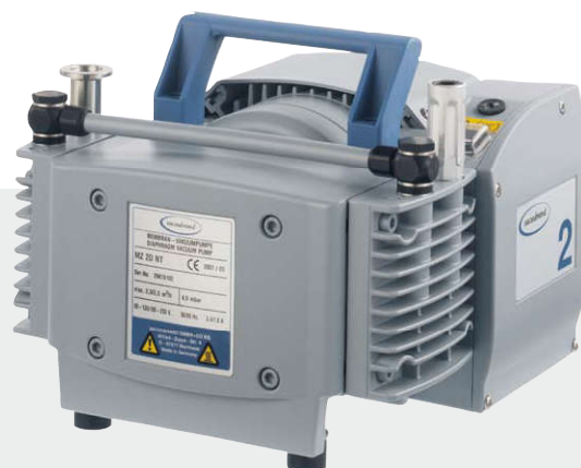
MZ 2D NT 2.3 m 3 /h 4 mbar