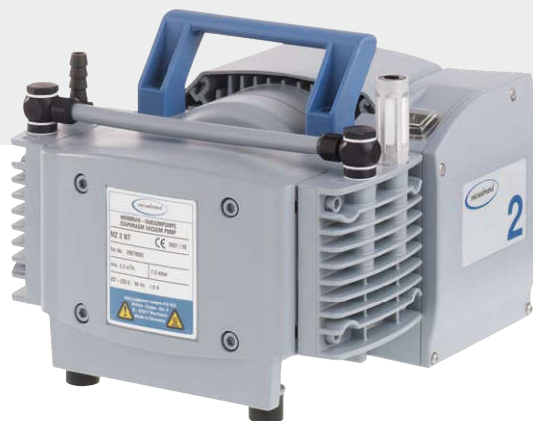
MZ 2 NT 2.2 m 3 /h 7 mbar